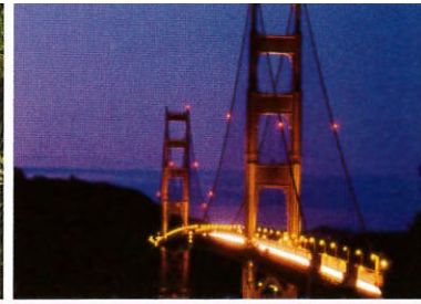
Coastal CA/Mexican Riviera