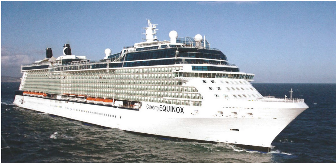
The Solstice Class of Ships

We will leave a day early and overnight in Ft. Lauderdale in a nice hotel where breakfast will be included in the morning before we board the ship.